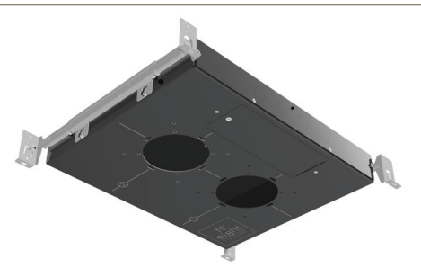
805-2 – RECESSED LED HOUSING