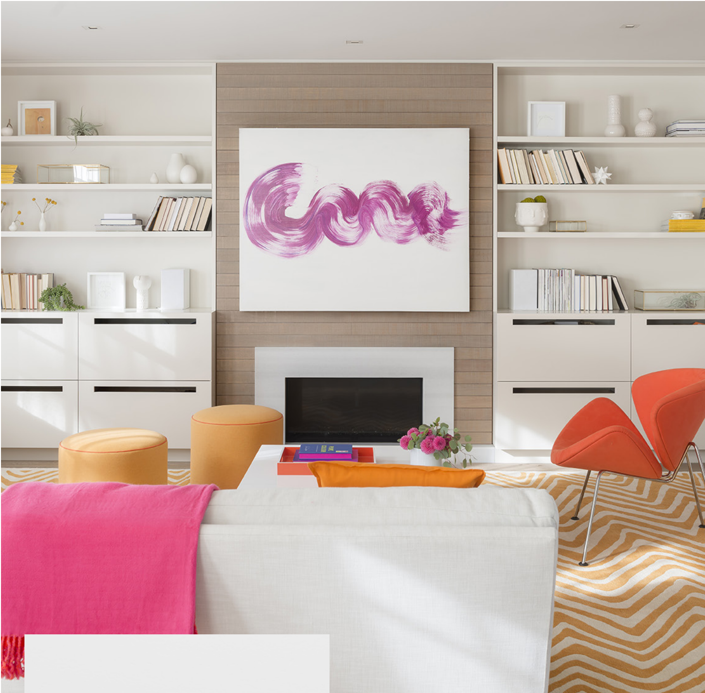
ARCHITECT: BUTLER ARMSTRONG INTERIOR DESIGN: ANNE SCHREIBER INTERIORS DESIGN GENERAL CONTRACTOR: UPSOALE CONSTRUCTION