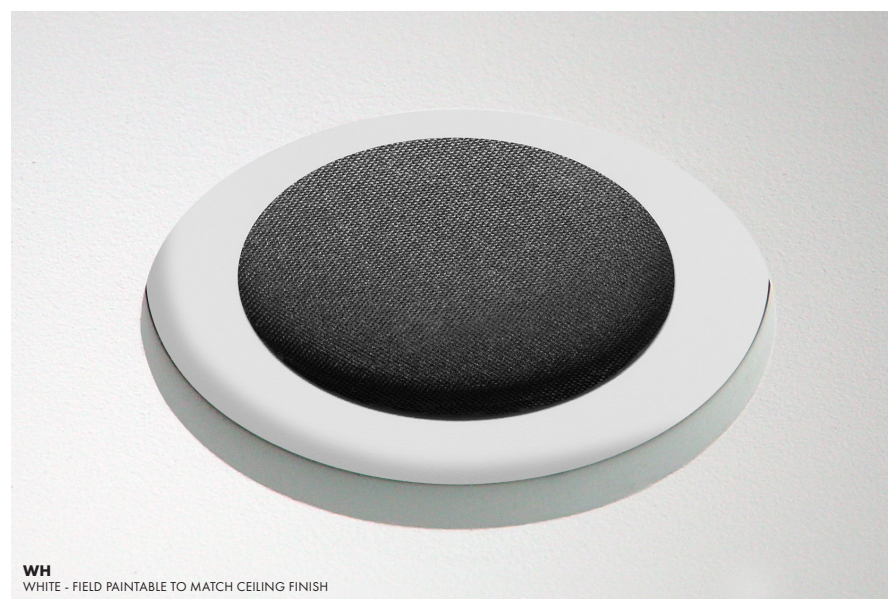
WH WHITE - FIELD PAINTABLE TO MATCH CEILING FINISH