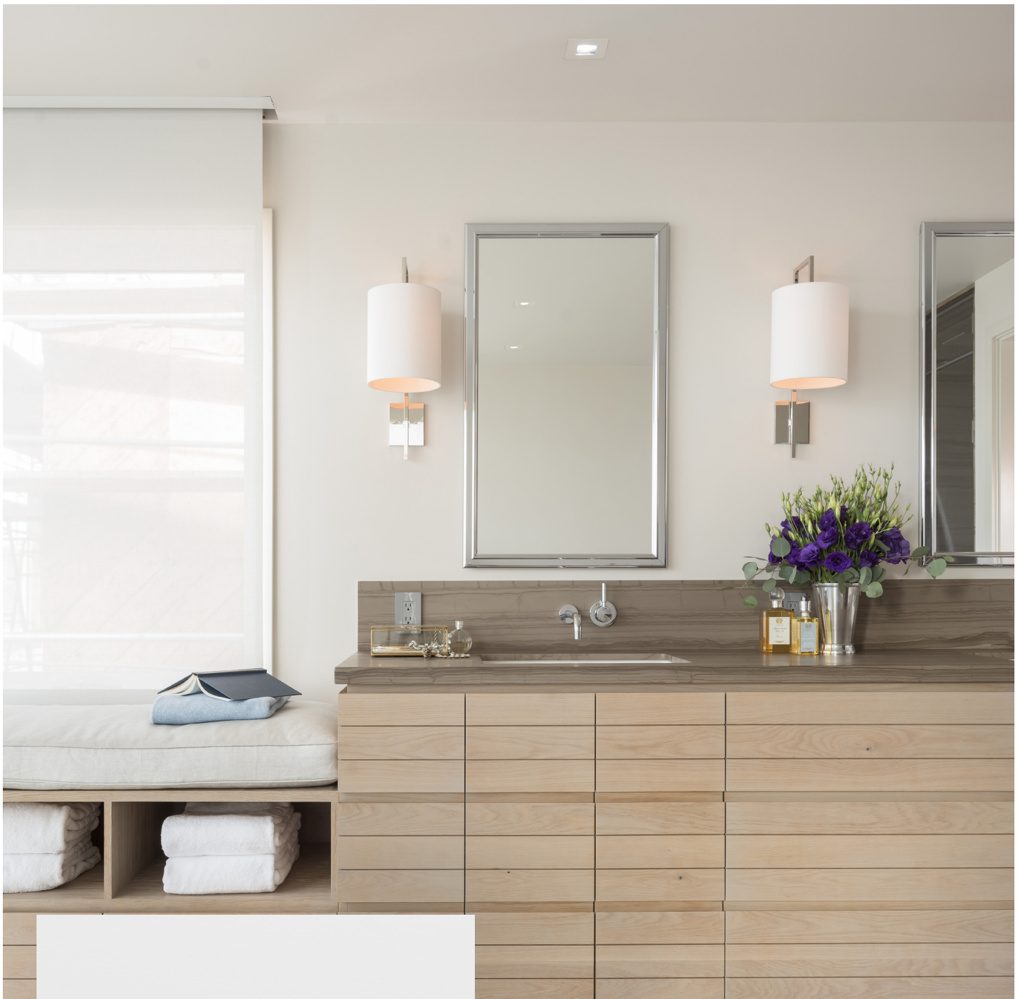
ARCHITECT: BUTLER ARMSTRONG INTERIOR ARCHITECTURE - INTERIOR DESIGN GENERAL CONTRACTOR: UPSHOLE CONSTRUCTION