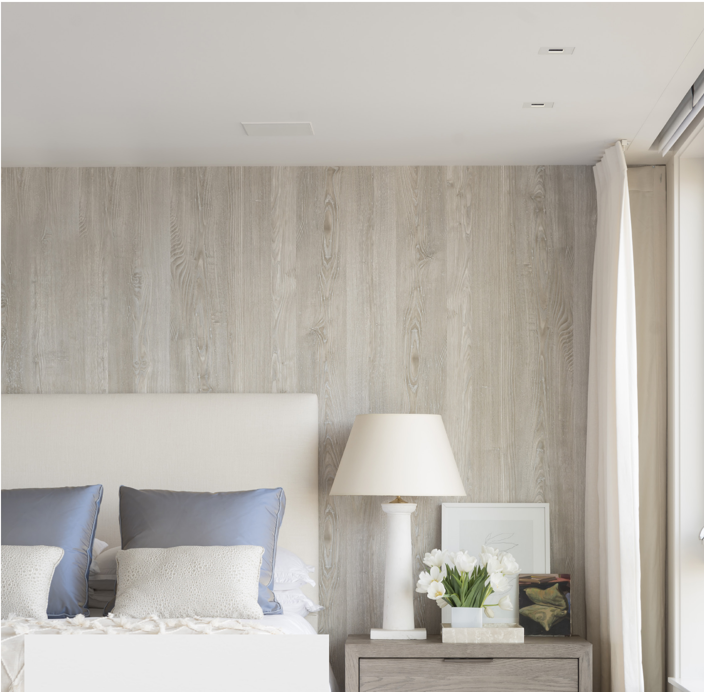
ARCHITECT: BUTLER ARMSTRONG INTERIOR ARCHITECTURE DESIGN GENERAL CONTRACTOR: UPSHOLE CONSTRUCTION