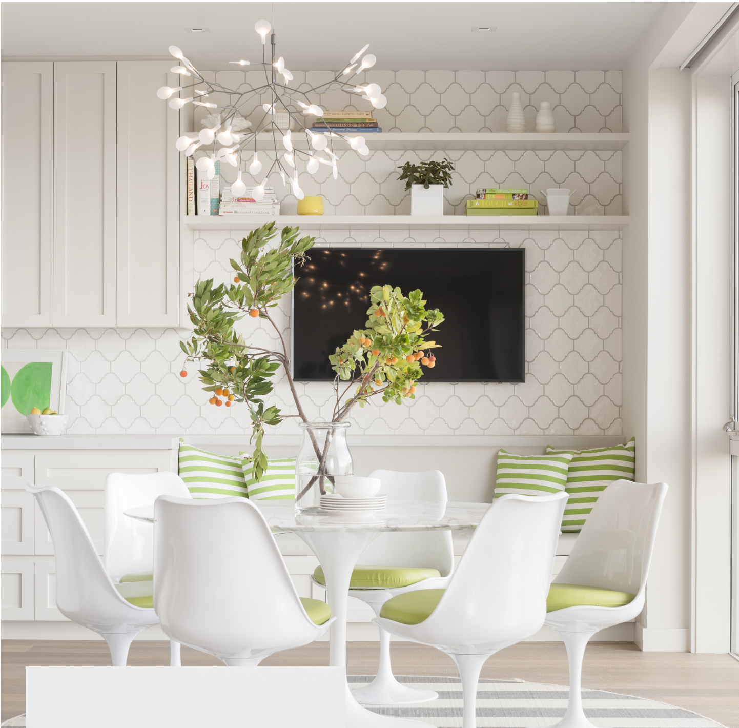
ARCHITECT: BUTLER ARMSTRONG INTERIOR DESIGN: ANNE SCHREIBER INTERIOR DESIGN GENERAL CONTRACTOR: UPSHOLE CONSTRUCTION