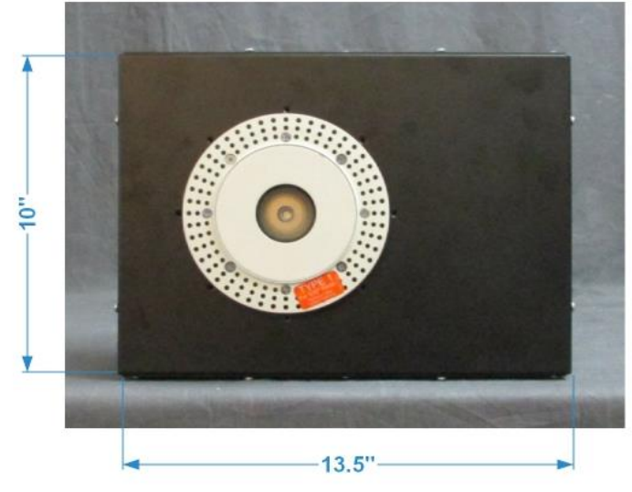
FIG. 1 LUMINAIRE