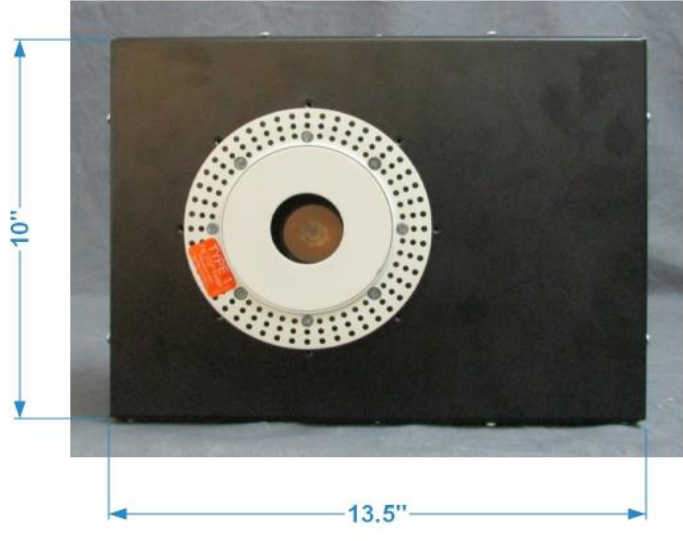
FIG. 1 LUMINAIRE