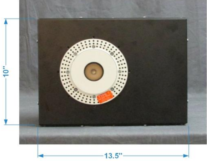
FIG. 1 LUMINAIRE